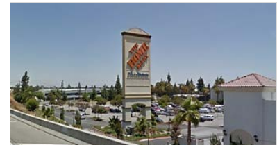
Freeway Signage from 60 fwy