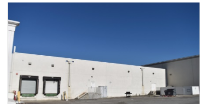
Dock Loading for 2721 S Towne