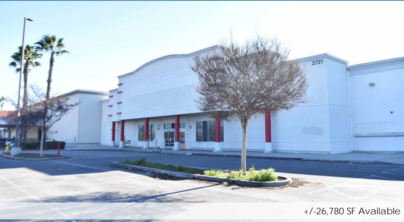
+/-26,780 SF Available