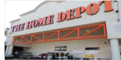
Home Depot Anchor