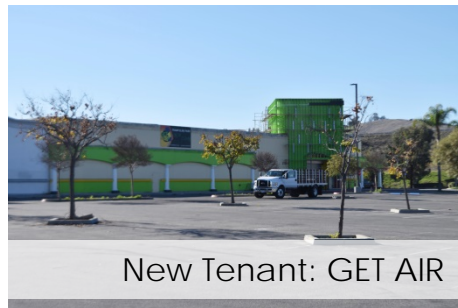
New Tenant: GET AIR