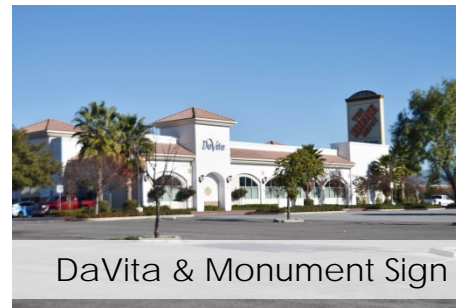
DaVita & Monument Sign