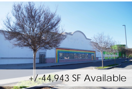
+/-44,943 SF Available